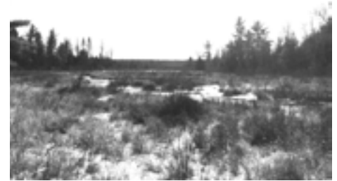
In winter, the Great Meadow is barren but teeming with wildlife

One of the very important things about Tuftonboro's Great Meadow is its remoteness, and it