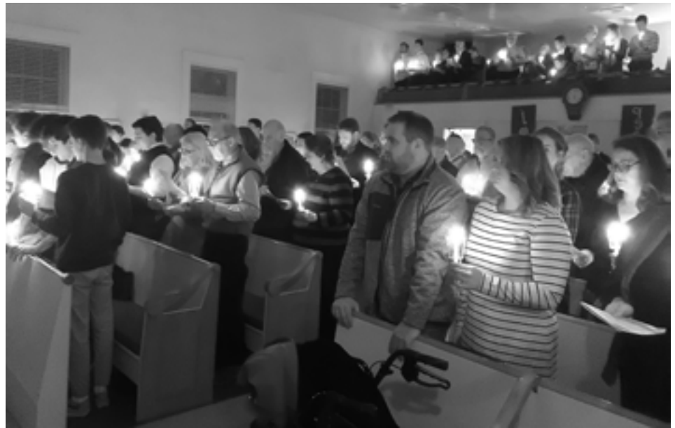
A traditional candlelight service was held on Christmas Eve.

Sunday morning worship begins at 10 a.m. and provides a place to enjoy music through the bell choir or special music. The service offers Christian fellowship and involves God-centered, Bible-based teaching (Love God, Love others. Mark 12:30-31.) The MVCC is an active church in the local community, helping those in need through the FEET FOR FUEL program. If you are a neighbor in need of fuel assistance, please call the church at 603.544.9661. The church will also host its Annual Church Fair and