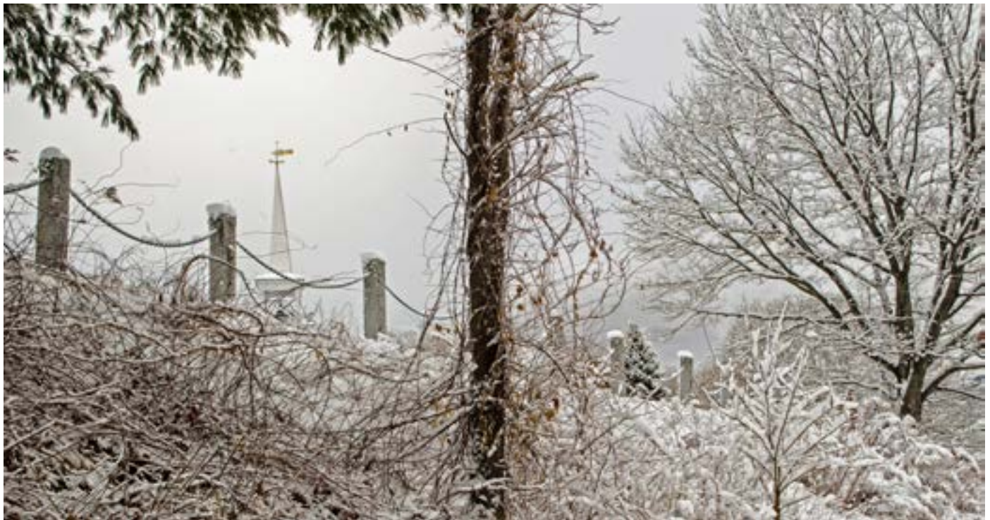
Melvin Village Community Church seen from Lake Street during a recent snowstorm.

The Tuftonboro Association P.O. Box 121 Melvin Village, NH 03850