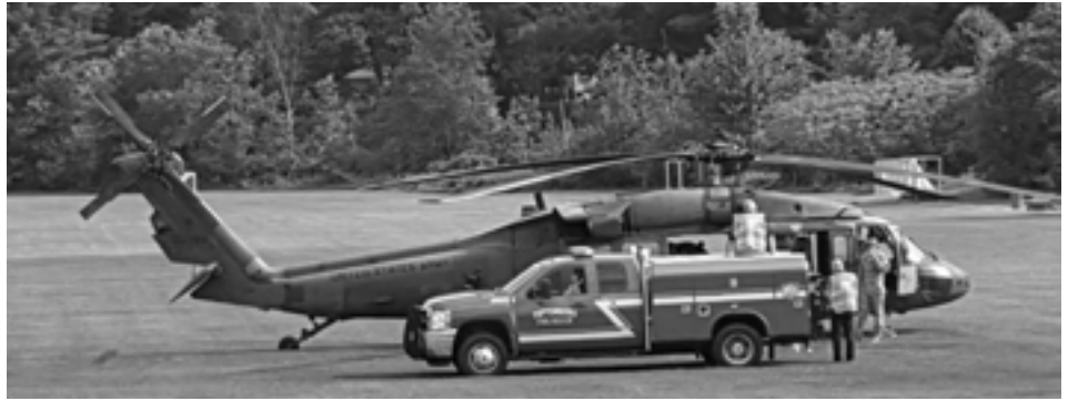
Tuftonboro Fire and Rescue shown taking part in a mutual aid exercise in Conway. This is Tuftonboro's Utility Two with the New Hampshire National Guard Blackhawk.

The winter has started with good early snow and ice on the lake. People will be out enjoying their winter activities: fishing, snowmobiling, skiing, shoveling and, everything in between. Use good judgement