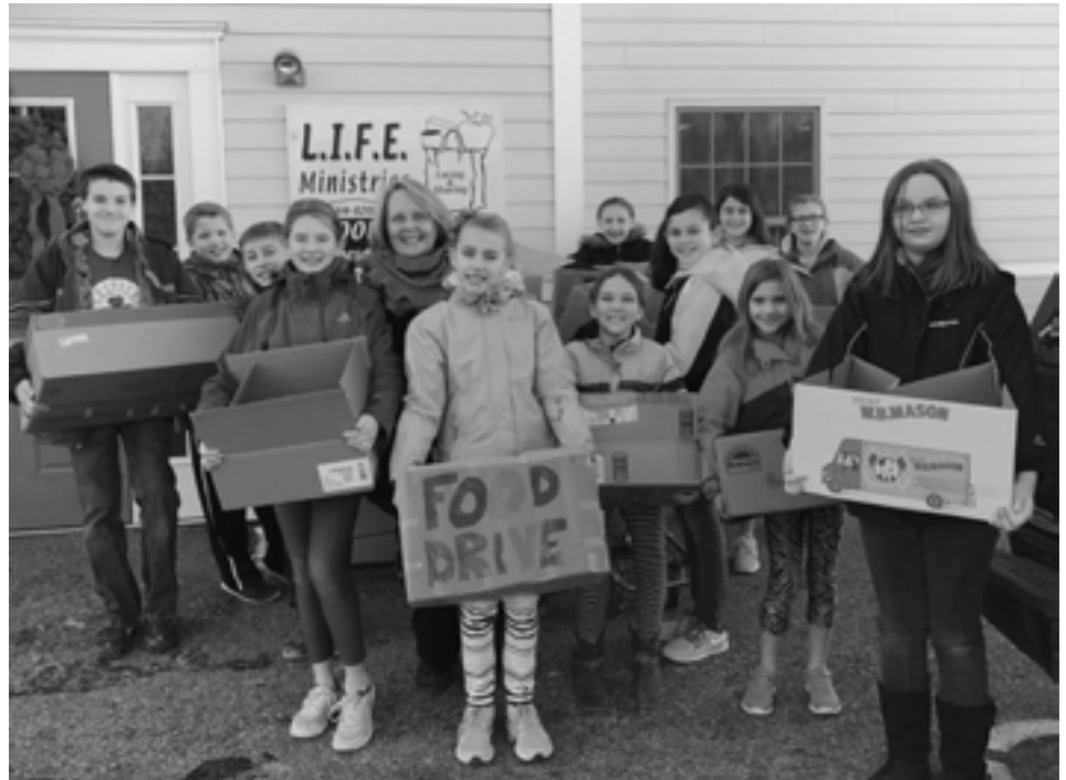
Tuftonboro Central School students visited the Life Ministries Food Pantry to deliver goods collected by the student council.

The Student Council collected a significant number of non-perishable items to bring to the Life Ministries Food Pantry in Wolfeboro during the month of December. Currently, they are organizing service projects for a school-wide Day of Service to learn more about Martin Luther King, Jr. day and to benefit the military, nursing homes, humane society, and community organizations. The Student Council will continue their efforts through the end of winter and into spring. It's very exciting to observe our