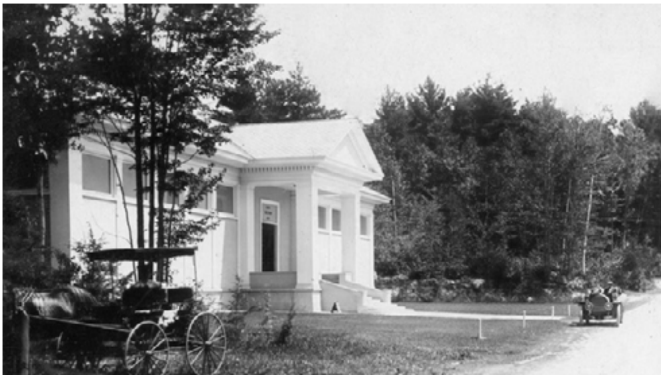
The Libby Museum as seen in 1912 when Dr. Libby's museum first opened. It is the oldest natural history exhibit in New Hampshire and is listed on the national historic register. Plans to restore and renovate the building are currently in design.

The Tuftonboro Association P.O. Box 121 Melvin Village, NH 03850