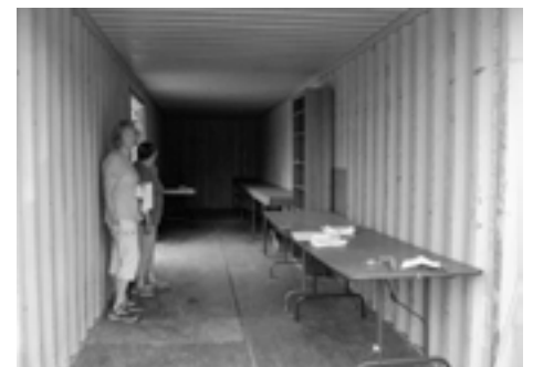
The Swap Shop is shown empty but ready for useable repurposed items