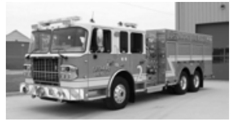
New baby photo of the replacement for Engine 2, taken at its birth place at Toyne Fire Apparatus in Breda, IA. June of 2019 (pre delivery)

The Tuftonboro Fire Rescue Department is in its 81 st year. I would like to thank all of the past and presents members and their families for their dedication and service to their community. It's great to hear from the members that served on the department