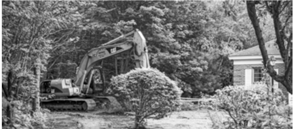
A large excavator behind the library is starting on the site work necessary for the construction and renovation of the building.

Please note that due to space and construction constraints, the library cannot accept donations of used books, CDs, DVDs, or puzzles until further notice. Alternative local options include the All Saints Church Summer Fair (drop off at the Parish Hall