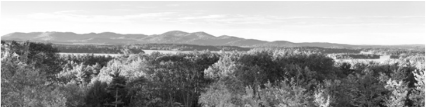
Panoramic view looking south from Abenaki Tower after tree-clearing.