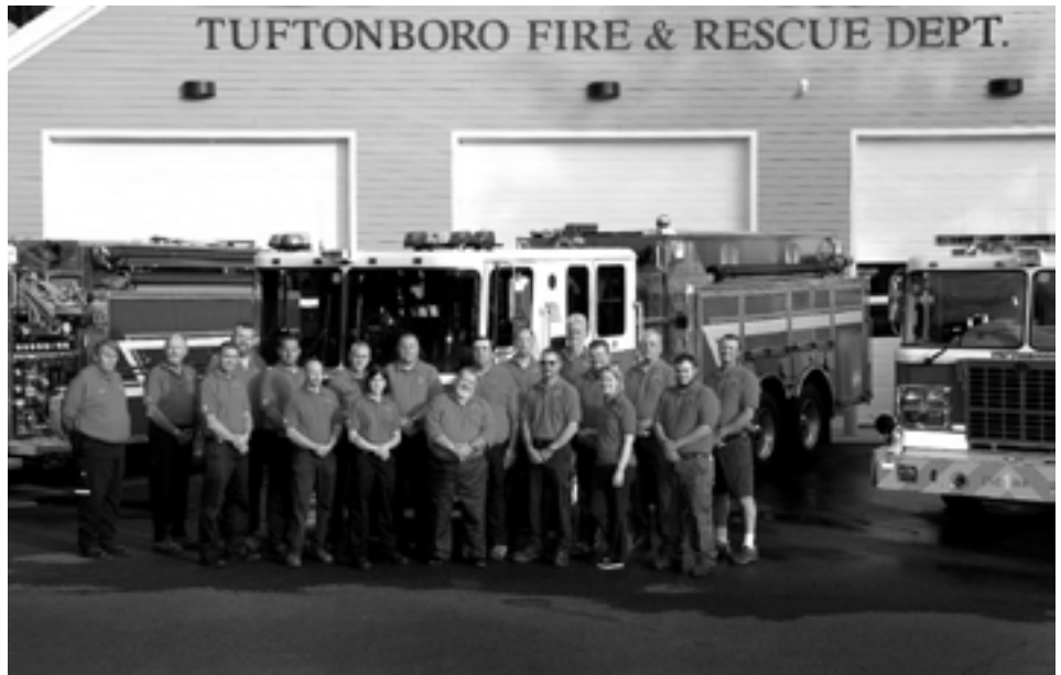
Members of the Tuftonboro Fire & Rescue Department.

If you will be in a power boat, check your electrical system and fuel system for gas fumes.