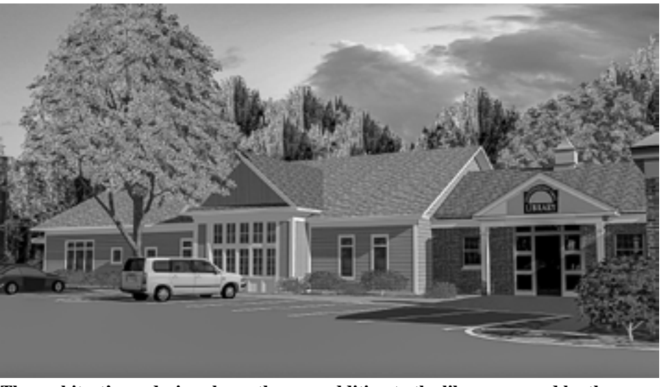
The architect's rendering shows the new addition to the library, passed by the voters at Town Meeting in March. Image by SMP Arichtects

As with any building or renovation project, a certain amount of disruption in normal library activities can be anticipated. Although there is not yet a construction schedule, the staff and Trustees have already discussed possible changes in open hours, and/or days of operation, among other alternatives.