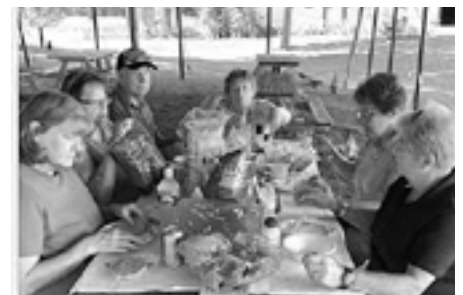
Members of the Tuftonboro Grange enjoy lunch at the NH Farm Museum.

The Tuftonboro Grange is a non-partisan, non-