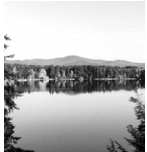
Mount Shaw, tallest of the Ossipee mountains, reflected in Mirror Lake.

There are several actions homeowners can take to prevent phosphorus from entering the lake. All efforts are directed at stopping stormwater runoff from entering the lake directly and include: