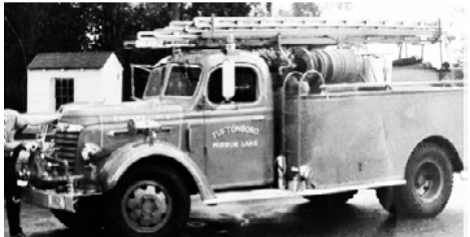
Long since retired, the original Engine No. 2, has evolved into a bigger and better new Engine No. 2, which was commissioned and put into service in July 2019.