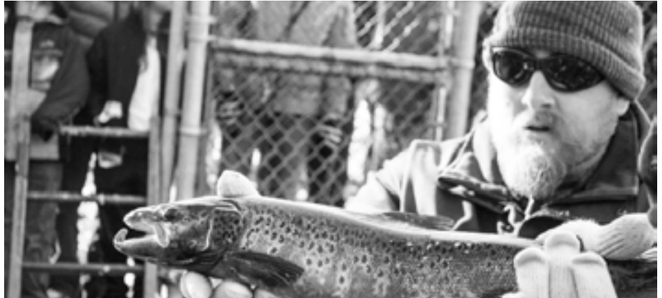
A fish & Game biologist holds up a large landlocked salmon for all to see during last year's Salmon Stripping Sunday demonstration.

Fish for the stripping demonstration are netted from Lake Winnepesaukee during October and early