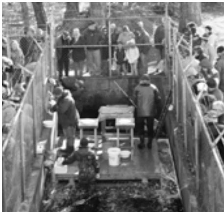
Spectators gather around the enclosure at Pope Dam to see the salmon stripping.