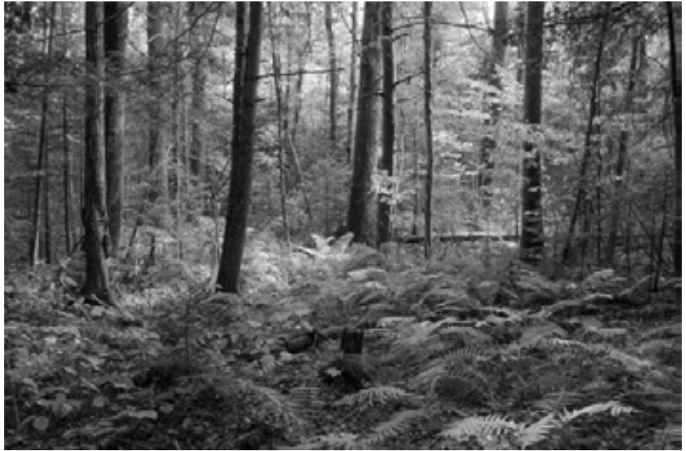
Fern garden on the path to the Great Meadow