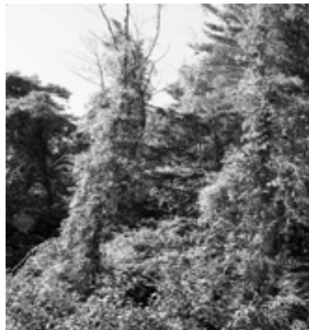
Oriental Bittersweet controlling the landscape.

Our next most nasty alien is oriental bittersweet. This Asian transplant is a climbing vine that is still popular for making wreaths with the characteristic red berries. Birds love the fruit, spreading the seeds across the landscape. Once established, the vine will climb the nearest tree or shrub. It gains support by winding around its victim. It works its way to the top then produces foliage that covers the native vegetation, blocking the sunshine. In the end, the victim is either strangled by the vine or dies from lack of sunshine. Sometimes the weight of bittersweet vines on a smaller trees or shrubs will cause it to collapse into a tangled mess. You can also see bittersweet encasing road signs, utility poles and supporting guywires. Bittersweet also spreads through sprouts from its roots. Once established it grows very dense, climbing on anything available, even itself. The area quickly becomes an impenetrable jungle of vines.