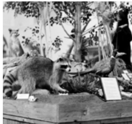
Exhibit at the Libby Museum