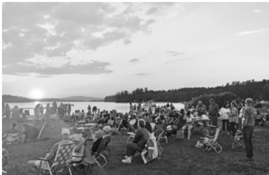
Carolyn Ramsay Band performs at the Tuftonboro Pavilion

The Friends of the Tuftonboro Library sponsored a Book and Breakfast with author Hal Lyon. The breakfast offered a selection of bagels and pastries, quiche, fresh fruit, coffee, tea, and hot chocolate. The program was funded in part by New Hampshire Humanities.