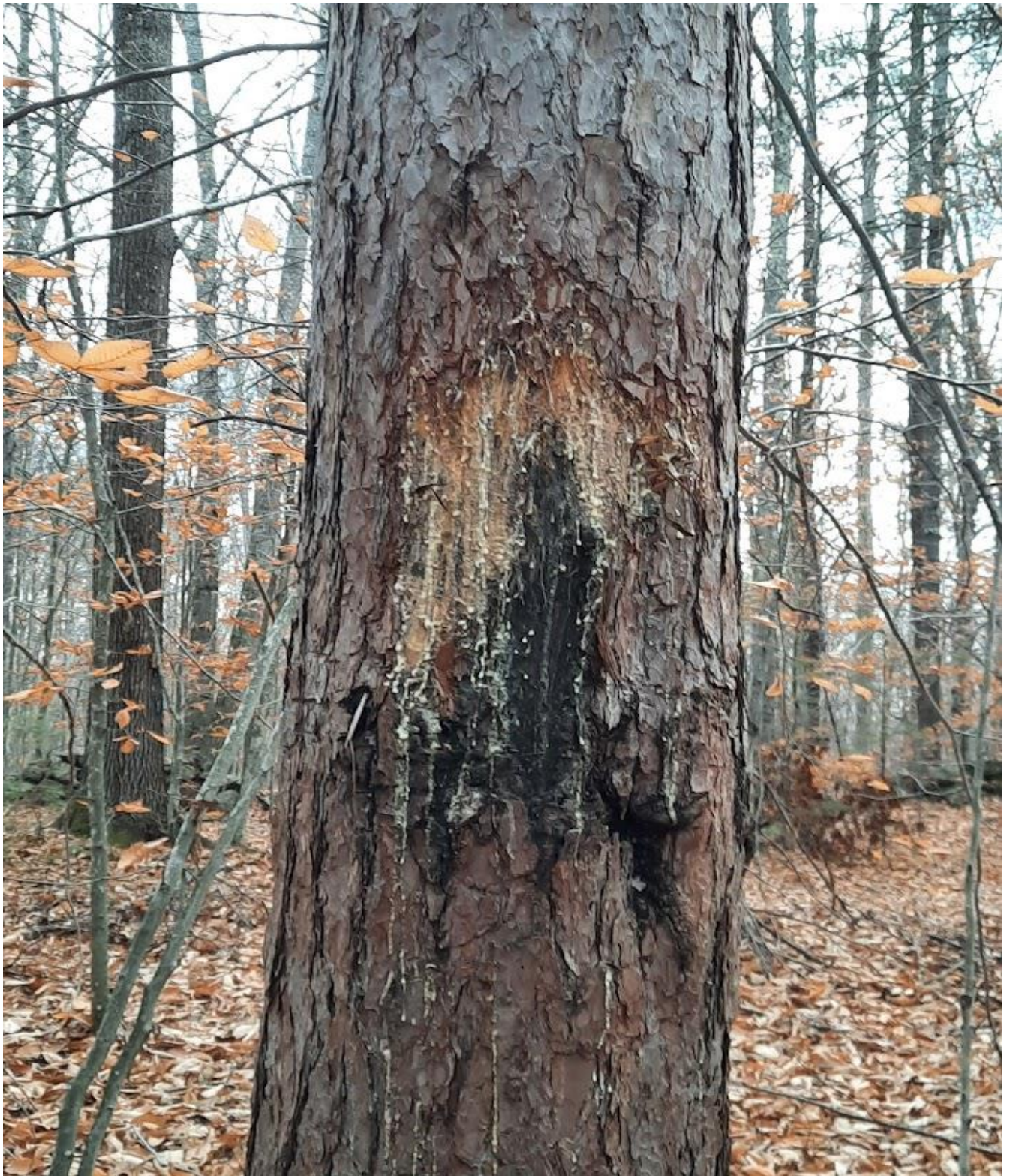
Bears do live on the Gould Lot