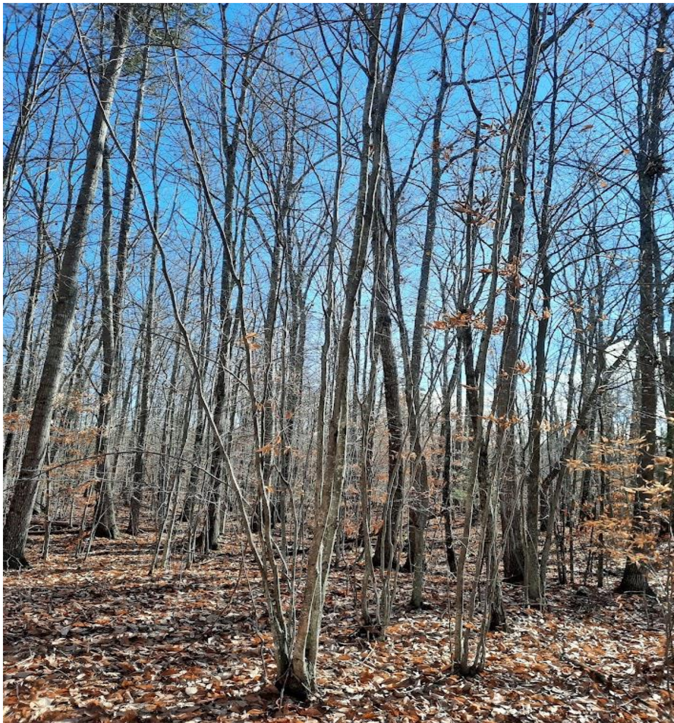
Young Red Oak/ Hardwood in Stand 2