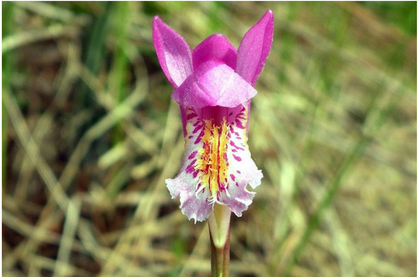
Arethusa bulbosa- dragon's mouth orchid