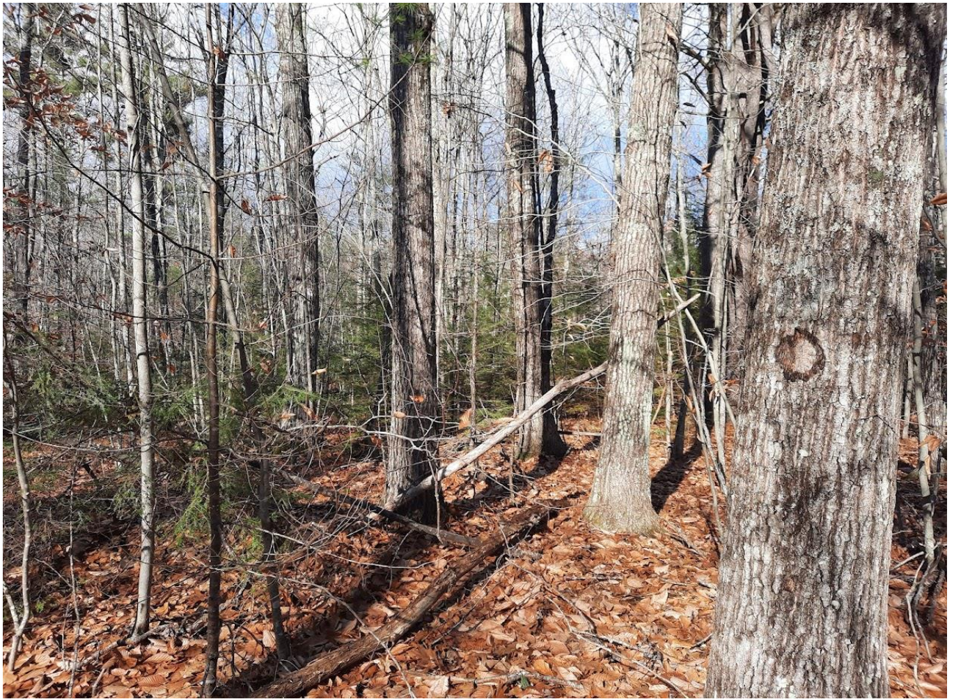
Red Oak in Stand 1

Climate is the most important consideration in the management of our forests. The primary management goals for this forest are to properly space the existing trees in each stand, while maintaining high stocking levels. Growing the correct species on the soils that favor them leads to higher volume growth rates/acre, along with higher grades of hardwood timber. These management priorities lead to higher levels of carbon sequestration by the forest. A sensitivity to the forest's aesthetics along the hiking trails should be maintained during any timber harvests. A forest under management by a forester should be walked through by the forester every five years. The harvest prescribed in this plan is scheduled to take place within the next ten years. The harvest will result in proceeds, net to Tuftonboro, of approximately $14,475. See the stands below for details