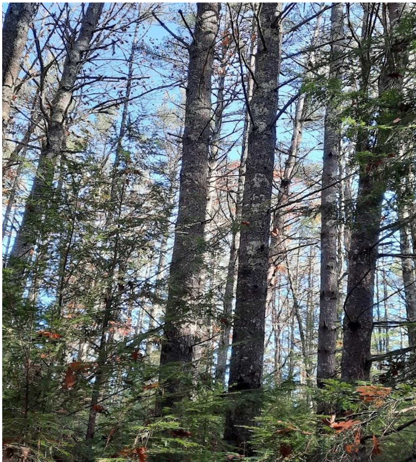
White pine in Stand 3