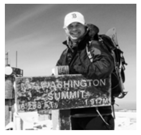
State Senator Jeb Bradley

During this session, we also passed a vitally