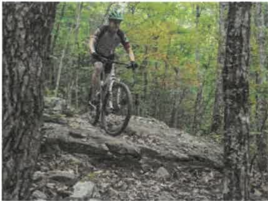
Examples of advanced level technical trail

Minimum of 12inch compacted tread with a minimum 4foot corridor.