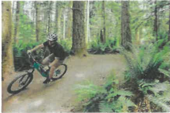
Example of compacted tread

Designed as an intro to mountain biking, this trail will take the rider from the top of the property back to the trailhead on a trail designed to build the riders skills with a safe groomed surface that has challenging terrain with the beginner as the primary user.