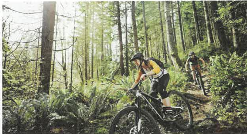
Example of intermediate technical section

The next step in progression, this will have some areas that reach 15% in grade with features such as rollers and small tabletops that allow the rider to progress. There will also be several technical sections that will be less groomed to a finish tread and allow the natural terrain to offer the challenge.